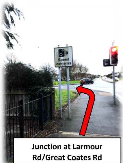
Junction at Larmour Rd/Great Coates Rd

After turning left here continue straight on for about \frac{3}{4} of a mile and you will come to another junction with a roundabout. You will also see the Trawl Pub ahead of you at this roundabout. Here you turn LEFT onto Yarborough Road.