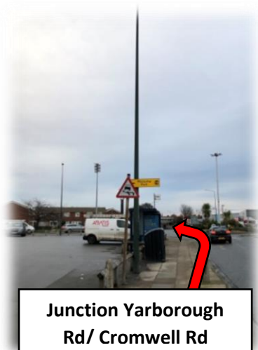
Junction Yarborough Rd/ Cromwell Rd

Once you have turned left onto Yarborough Road stay on this footpath for about another \frac{3}{4} of a mile until you come to another large 4-way junction with a roundabout at a crossroads. Here you turn LEFT onto Cromwell Road. You will see a small Tesco store on your left at this corner, DO NOT cut the corner across the car park, stay on the footpath.